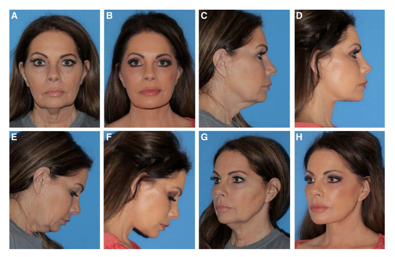
Fig. 3. Preoperative and 6-month postoperative views of a 56-year-old woman who underwent preservation face lift. A, Preoperative frontal view. B, Postoperative frontal view. C, Preoperative right-profile view. D, Postoperative right-profile view. E, Preoperative right-profile view, looking downward. F, Postoperative right-profile view, looking downward. G, Preoperative left three-quarter view. H, Postoperative left three-quarter view.

the preservation face lift group and 61 y for the deep plane face lift group, P = 0.39). The proportion of female patients was similar between the groups (96% in the preservation face lift group and 94% in the deep plane face lift group, P = 0.44). The proportion of smokers was generally comparable between the groups, with a slight tendency towards a higher proportion of smokers in the preservation face lift group (P = 0.07). The duration of drainage was significantly shorter in the preservation face lift group (P = 0.00001).