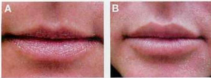
Figure 6. A: preoperative photograph. B: Patient at six months after autologous fat grafting with PRP to lips.

unresponsive wounds displayed re-epithelialization. Ganio et al 15 displayed a 78% limb salvage rate among a series of 171 patients with a total of 355 wounds of average 75 weeks' duration after daily treatment with a platelet-derived wound-healing factor concentrate for an average of 10 weeks. In the field of oromaxillofacial surgery, Marx et al. reported enhancement of bone formation on bone biopsy specimens in mandibular bone grafts after treatment with PRP. 17 Relevant to facial plastic surgery, Powell et al reported trends that may suggest enhancement of recovery with decreases in postoperative edema and ecchymoses in a pilot, randomized, prospective, controlled clinical trial involving 8 female patients treated with autologous