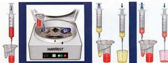
Figure 1. Isolation of PRP. Stage 1-Transferring whole blood into blood chamber. Stage 2-Load SmartPREP.® Stage 3-After processing, Platelet Poor Plasma (PPP) is isolate (Yellow). State 4-Then Platelet Rich Plasma (PRP) is isolated (red). Closed Syringe Harvest of Autologous Fat.

Figure 3 displays a female patient 1 year after autologous fat grafting with PRP to the nasolabial folds