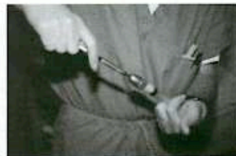
Figure 2. Addition of PRP Isolate to Graft Material.

Figure 7 shows a woman 2 years after autologous fat grafting to the breast. The patient displays a continued fullness. Although there was much improvement in