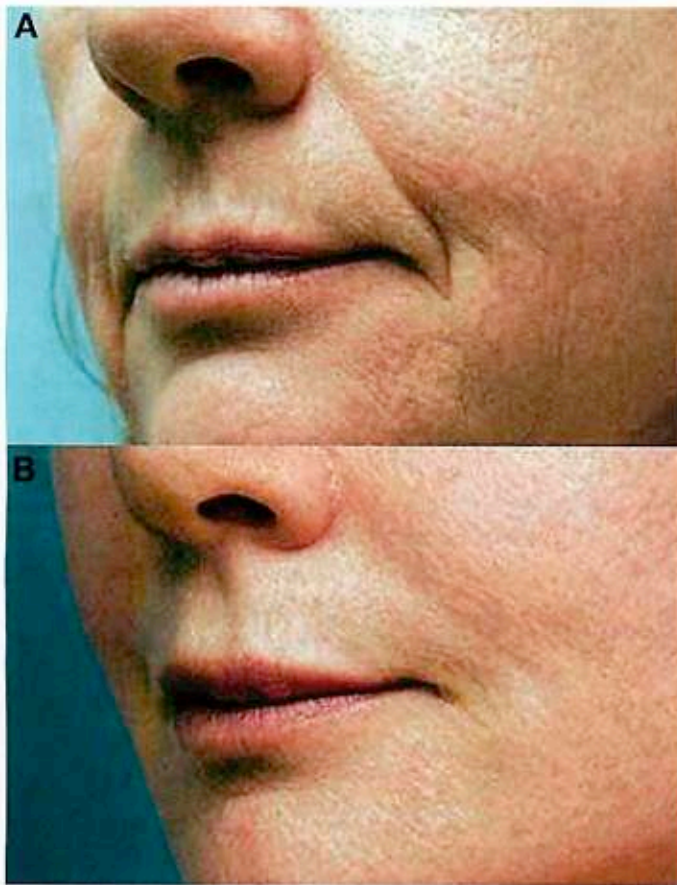
Figure 3. A: Preoperative photograph. B: One year after autologous fat grafting with PRP to nasolabial folds and lips.

breast fullness, she is receiving more fat graft for slightly larger breast at a second stage. Mammographies preoperatively, at 6 months, and then annually have revealed no abnormalities or cystic calcifications.